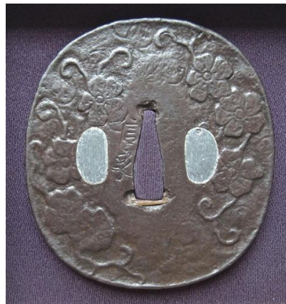
15. Tsuba Kiyo Sukashi Matsu